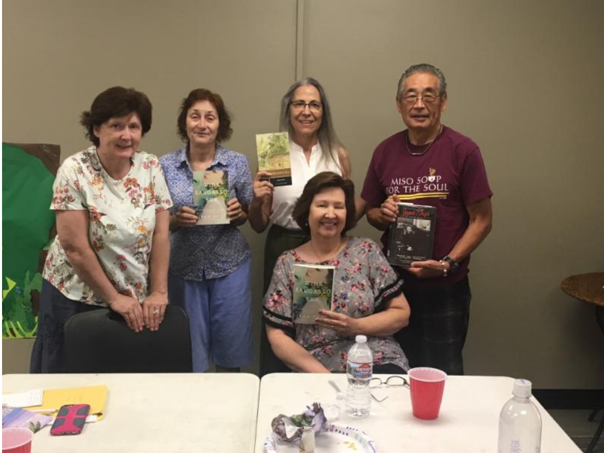
San Gabriel Valley Reading Group