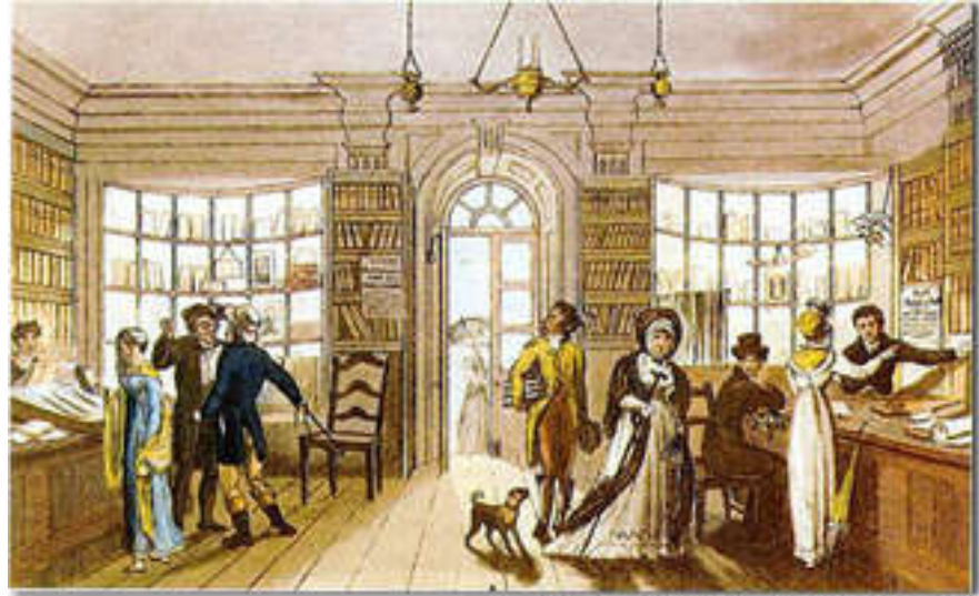
The Circulating Library in Scarborough circa 1818