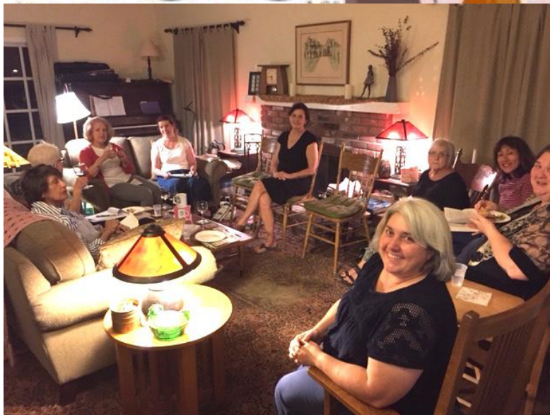
Pasadena Area Reading Group