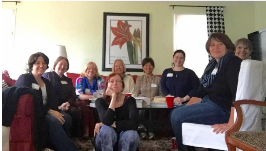
The Long Beach Reading Group at a recent meeting

Send us photos from your reading group so we can share them here, on our Facebook page and/or the JASNA-SW website.