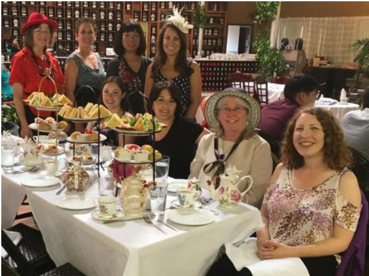
South Bay Reading Group